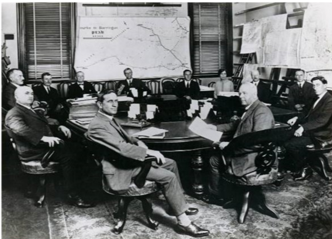
Public Accounts Committee – 21 April, 1924