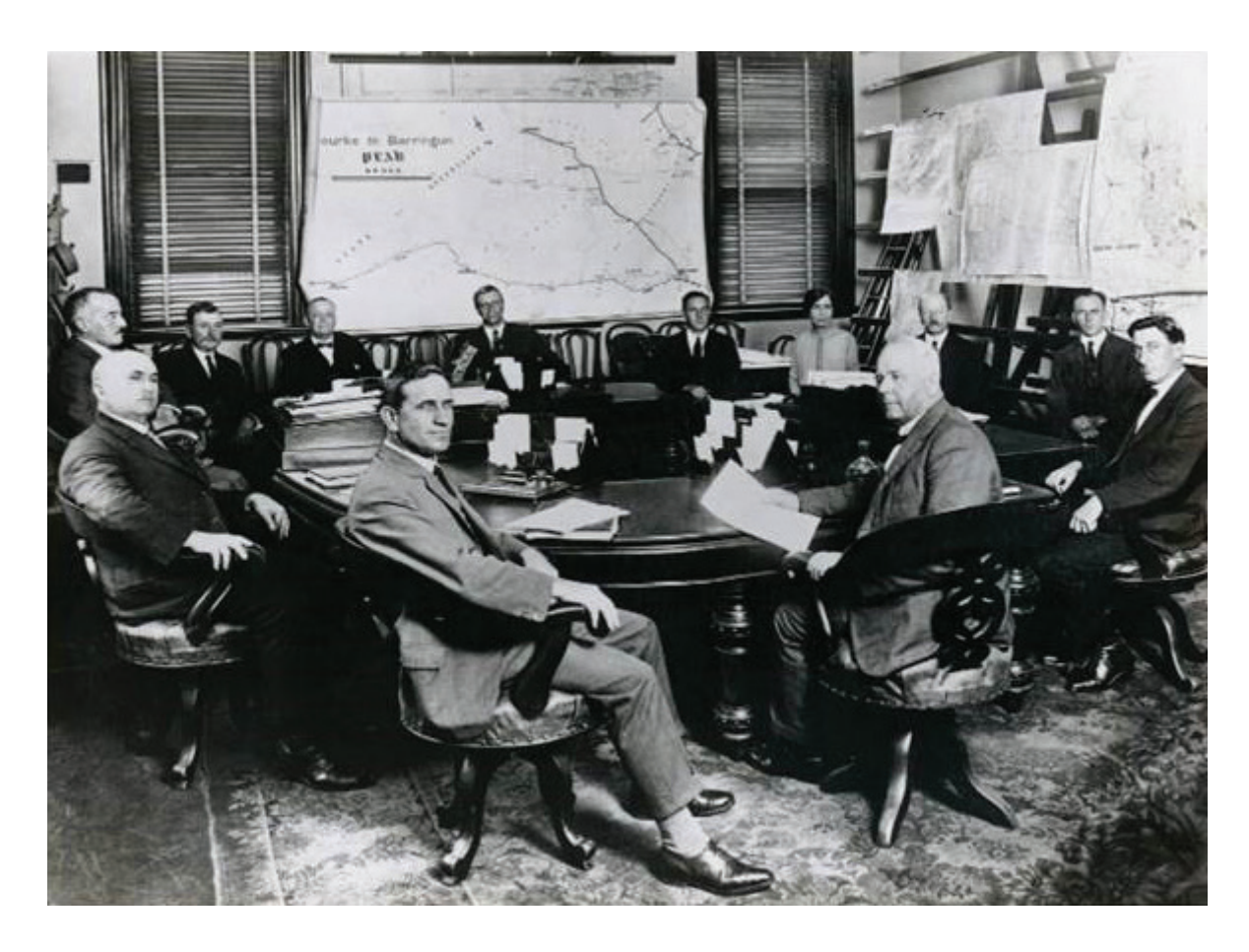
Public Accounts Committee – 21 April, 1924