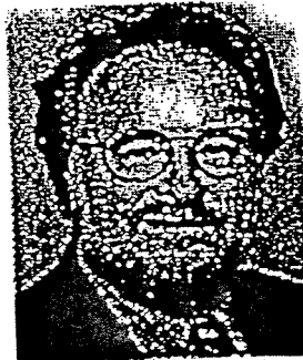
Alan Ashton MP